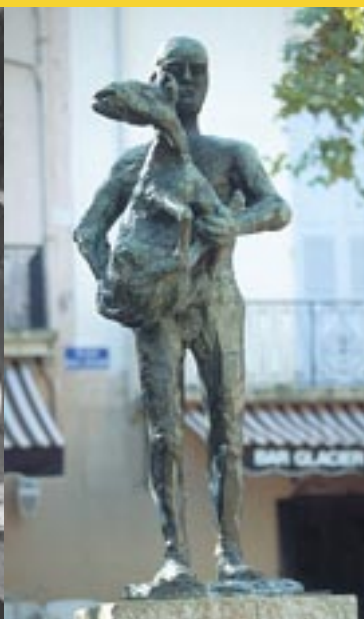
Statue de l'Homme au Mouton Picasso