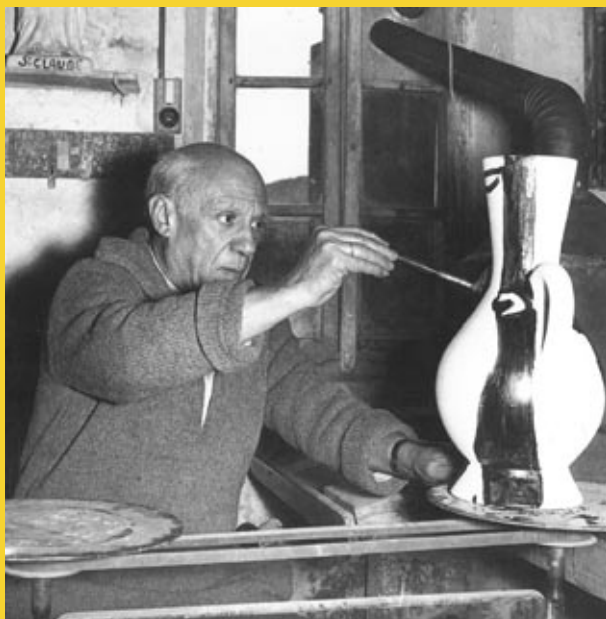
Illustrations : Picasso chez Madoura