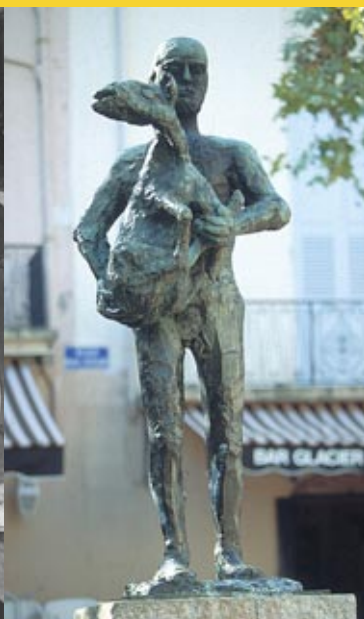
Statue de l'Homme au Mouton Picasso